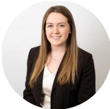
Abby PR/Communications from Minnesota