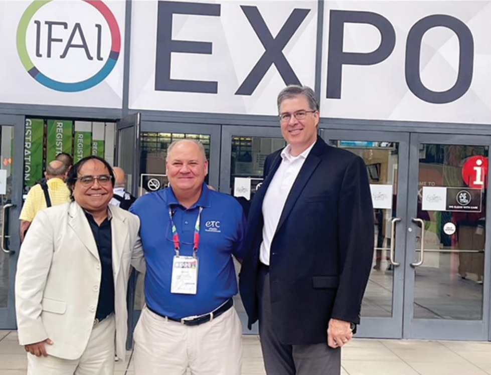
IFAI Expo November, 2022

Due to natural disasters, bale production was forecasted to drop in the US and India for 2022-23. Congestion and labor disputes in Europe caused global freight rates to fall 8%. The US WestCoast also faced congestion as well